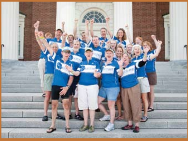
The 2011 Spectrum Trek Team celebrates on the steps of Colby College.